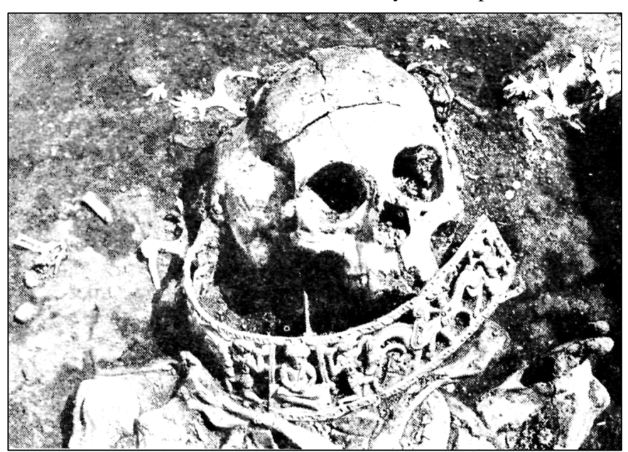
Figure (2) Shows burial in the mound 10, Kobyakov burial ground. (by Guguyev1992).

in the political life of the Bosporus. Thus, the Sarmatians were one of the important centers of power in the steppe zone of Eastern Europe, which was opposed by the Bosporus.